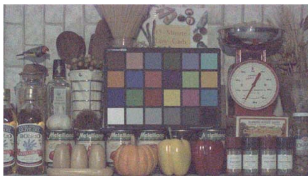
IMX290LQR Internal gain 63 dB

Condition 2: 0 lx (850 nm IR) F1.4 (Full HD image, 30 frames/s)