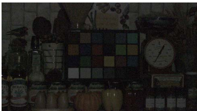
Existing IMX236LQJ Internal gain 48 dB

Condition1: 0.08 lx F1.4 (Full HD image, 30 frames/s)