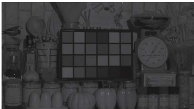
Existing IMX236LQJ Internal gain 0 dB

Condition 2: 0 lx (850 nm IR) F1.4 (Full HD image, 30 frames/s)