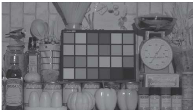
IMX290LQR Internal gain 0 dB