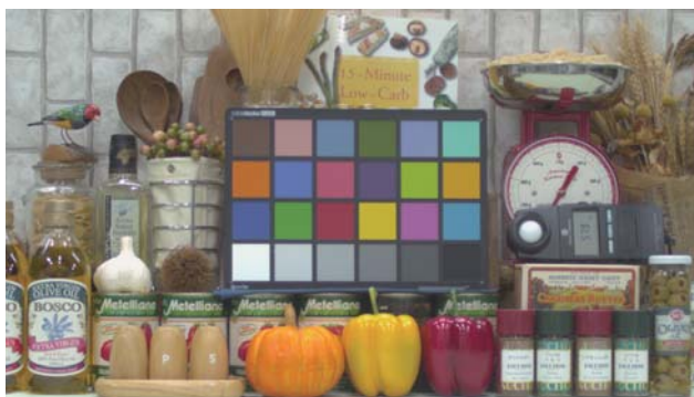
IMX290LQR (Internal gain 0 dB)

Condition: 400 lx F1.4 (Full HD image, 60 frames/s)