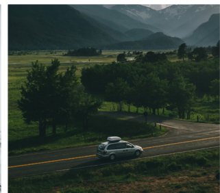
NEWS & WEATHER