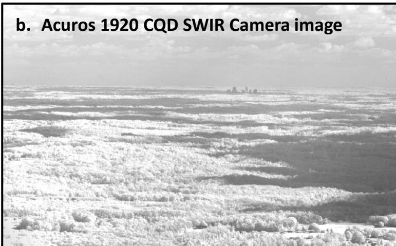
b. Acuros 1920 CQD SWIR Camera image

Images captured via SWIR Vision Systems Acuros™ CQD™ 1920 SWIR Camera with TEC and a 100 mm SWIR coated lens at ~5ms exposure time